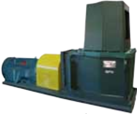
Top Entry Agitators