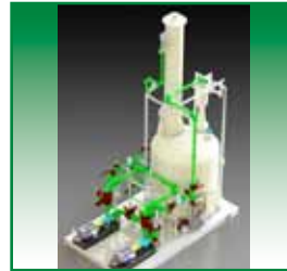
Process Gas Scrubbers