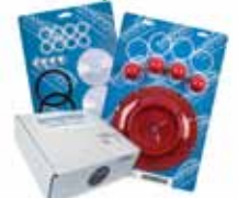
Replacement Parts All Brands