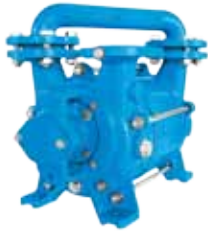
Liquid Ring Vacuum Pump