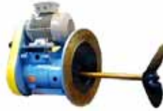
Side Entry Agitators