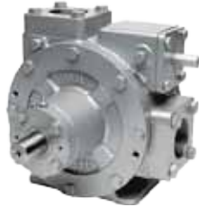
Sliding Vane Pumps