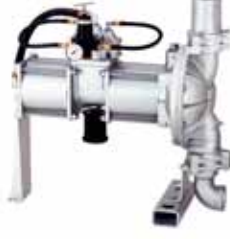
High Pressure AOD 2:1