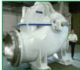
Split Case Pumps