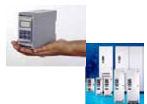
Load Monitors/ Drainage Monitors/ VFD