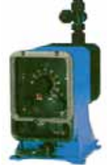
Solenoid Metering Pumps