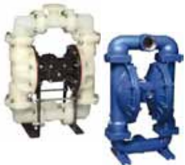
Air Op. Diaphragm Pumps