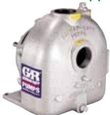
Self Priming Pumps