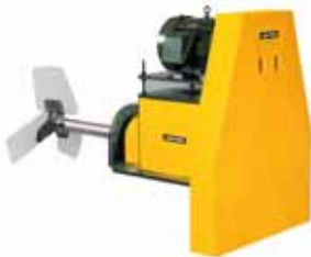
Side Entry Agitators