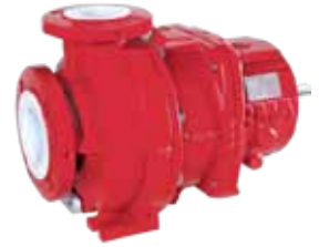
PFA Mag Drive