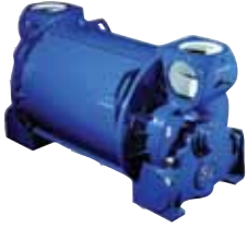
Liquid Ring Vacuum Pump