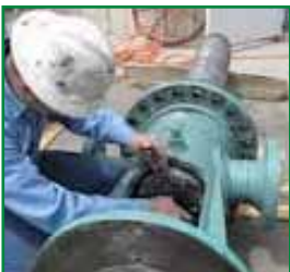
API Vertical Pumps