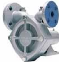
Regenerative Turbine Pumps