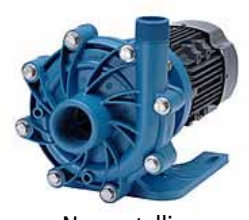
Nonmetallic Sub-ANSI Mag Drive