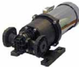
Sealless Gear Pumps