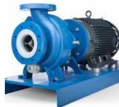
Lined Mag Drive Pump