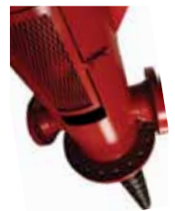
Vertical Turbine Pumps

Agitators • Pumps • Process Equipment • Rotating Equipment Repair