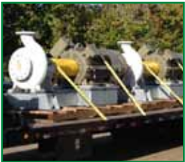
End Suction/ ANSI Pumps