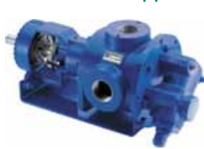
Internal Gear Pumps