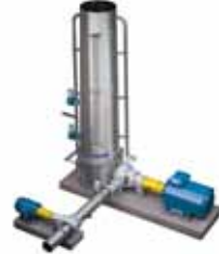
Air Handling Specialty Pumps