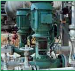
In-line Vertical API Pumps