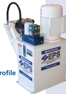
Vertical EPS Profile