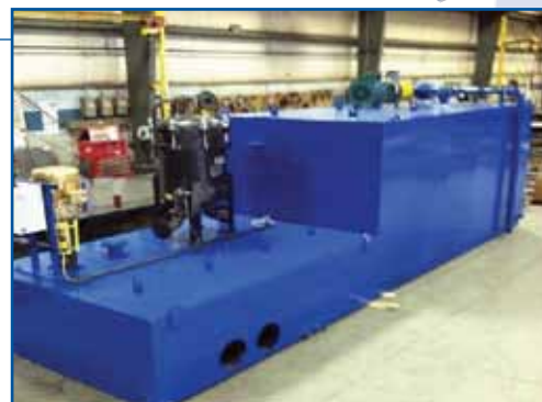
Custom Coolant Systems