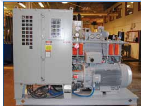
Custom Power Units